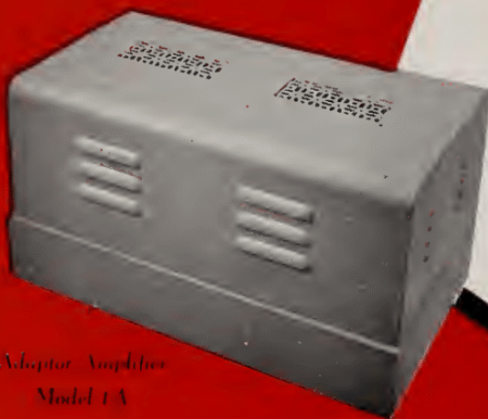
Adaptor Amplifier Model 1A