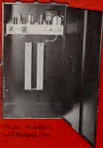
Studio Amplifier and Bridging Unit