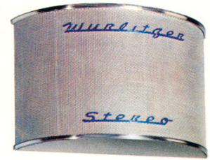
WURLITZER Stereo Extender MODEL 5125

12" full range fidelity speaker including 3 1/2" coaxial tweeter with baffle to enhance bass resonance. DIMENSIONS: 26" Wide, 20" High, 11" Deep