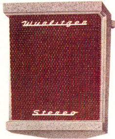
WURLITZER Corner Speaker MODEL 5124

ENABLE YOU TO CUSTOM-ENGINEER A WURLITZER STEREOPHONIC MUSIC SYSTEM TO THE NEEDS OF ANY LOCATION.