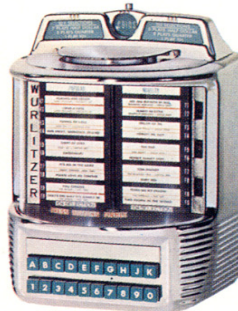
WURLITZER MODEL 5202 Wall Box 100 Selections DUAL PRICING 50¢ Play

Identical three-speaker complement as phonograph. Full fidelity stereo. DIMENSIONS: 33" Wide, 32" High, 15" Deep