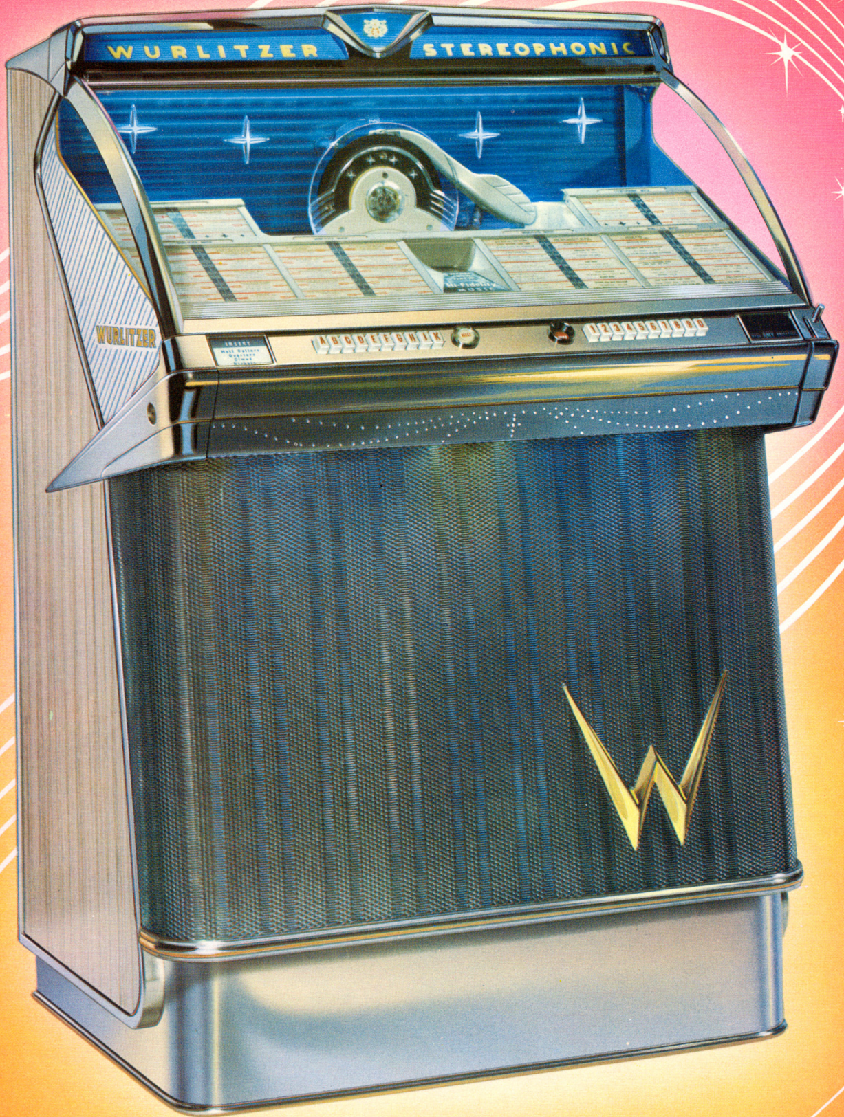
WURLITZER MODEL 2310S 100 SELECTIONS