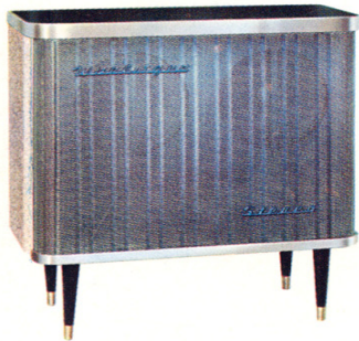
WURLITZER Console Floor Speaker MODEL 5122

Houses 6 x 9 speaker at 20° angle for extending stereo music throughout every location. Sold in pairs. DIMENSIONS: 12" High, 14" Wide, 8" Deep